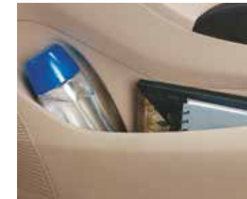
Map Pocket with Bottle Holder