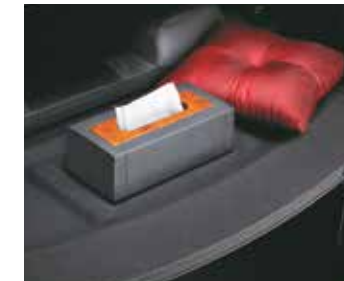
Rear Parcel Tray