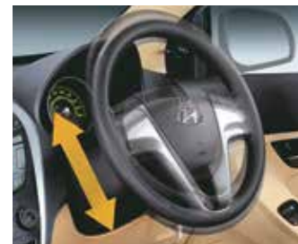
MDPS with Tilt Steering