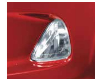
Front Fog Lamps

Moon Shaped Tail Lamps | Body Colour Door Handles Body Colour Mirrors