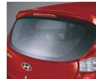
Integrated Spoiler with HMSL