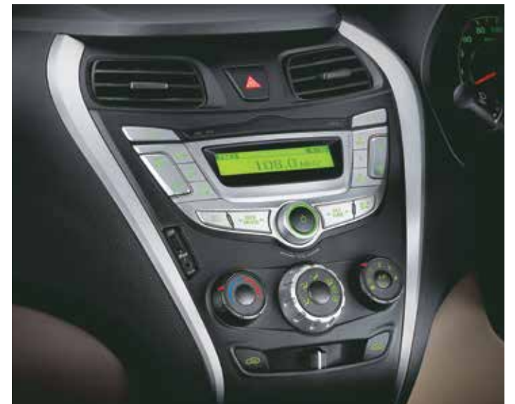
AC & 2 DIN Audio with AUX-in & USB Ports