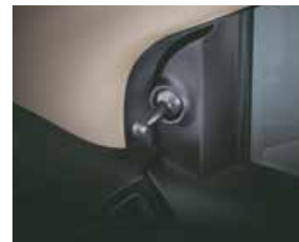
Internally Adjustable Outside Mirrors

When it comes to comfort or convenience, the Hyundai EON boasts of both in equal measure. It contains all the features you'll ever need; well designed and placed within easy reach.