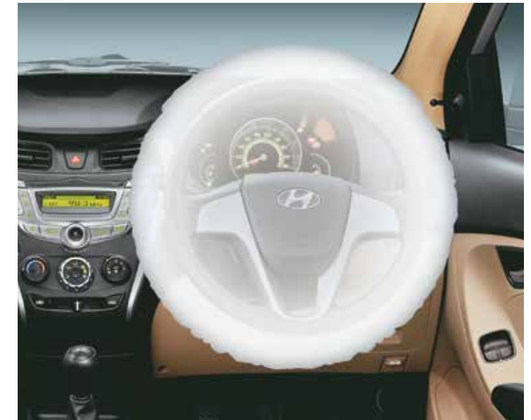
Driver Side Airbag

The Hyundai EON offers convenience beyond compare with ergonomically designed utility features and ample storage space. The interiors, an amalgamation of breathtaking design and function, make the Hyundai EON a statement like none other.