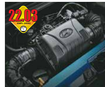
0.8L iRDE Engine

Hyundai has always been committed to making cars that are fuel efficient and easy to maintain. The EON is no exception. Powered by a mileage-friendly engine and features that enhance fuel-efficiency, this car is easy on your pocket.