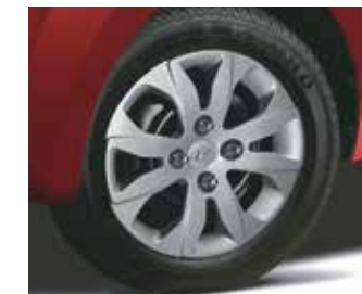
Full Wheel Cover