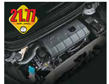
1.0L Kappa Dual VVT Engine