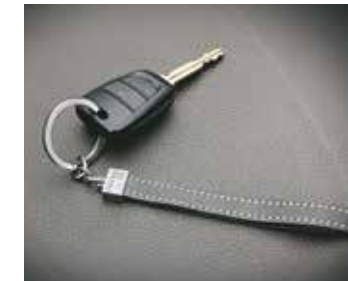
Keyless Entry & Central Locking