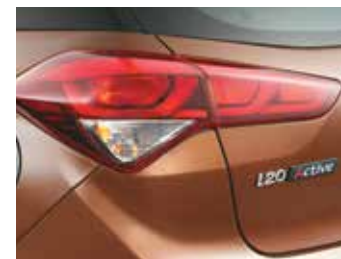
Unique Designed Tail Lamps