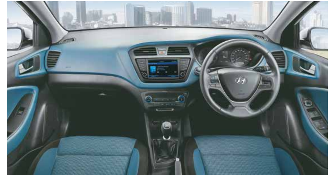
Two Tone Interior Key Colour

The spunky and stylish i20 ACTIVE is thoughtfully designed with vibrant interiors (with the options of Tangerine Orange and Aqua Blue) and ample space. The 1st in segment 7.0 Audio Video Navigation System comes with smartphone connectivity (Apple CarPlay, Android Auto and MirrorLink).