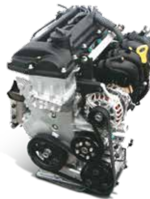
1.2L Kappa Dual VTVT Petrol Engine