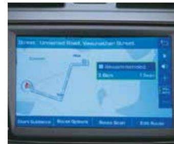
3D Map View