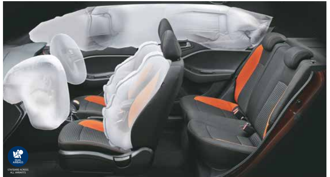
Six Airbags (Front, Side & Curtain)

The i20 ACTIVE has safety measures that always make you feel at ease. So whether you're chilling with your friends in the car or out on a trip, feel safe and enjoy the drive.