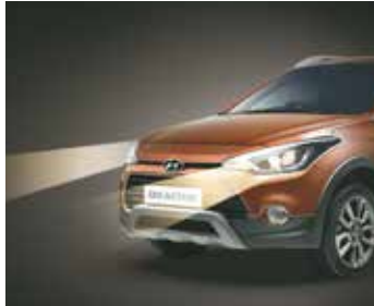
Headlamp Escort Function