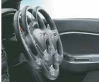
Tilt and Telescopic Steering