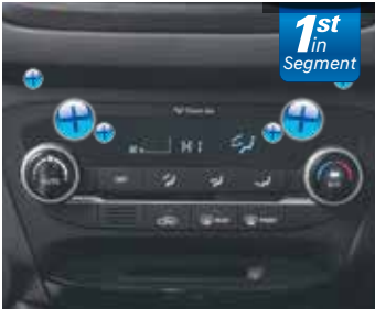
FATC with Cluster Ioniser