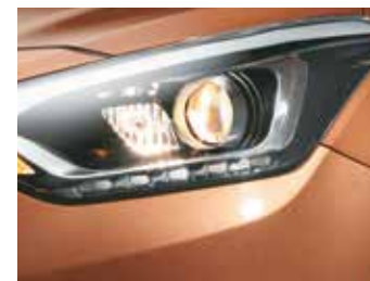
Projector Headlamps with LED DRL, Positioning and Cornering Lamps