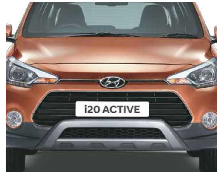
Front Air Dam with Two Tone Bumper and Silver Finish Skid Plates