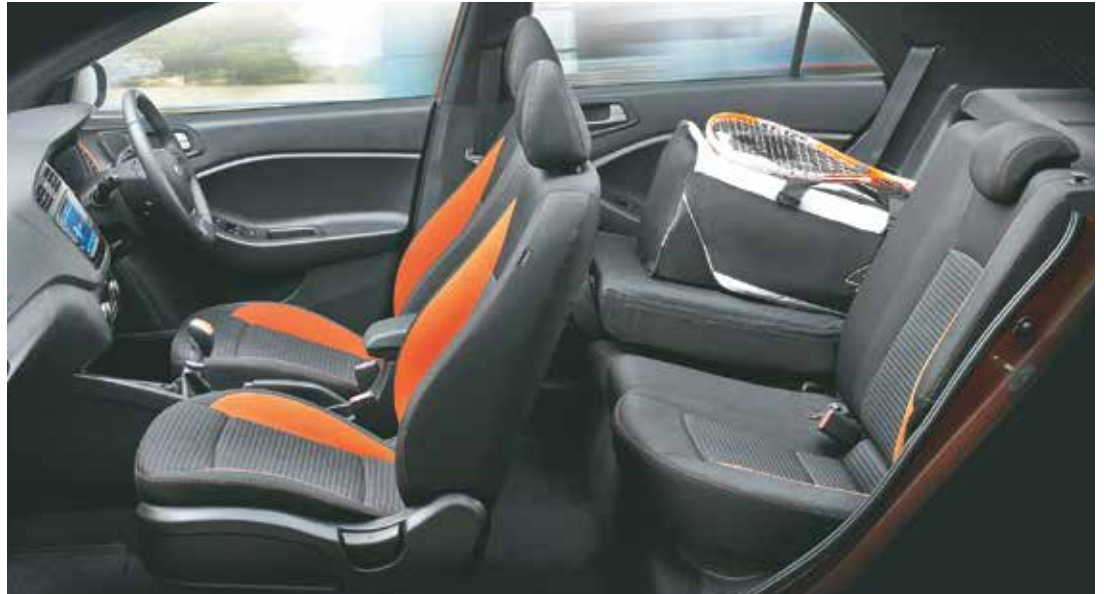
60:40 Split Rear Seat

Comfort is what makes every drive a pleasure. That's why, every inch of the i20 ACTIVE spells comfort and convenience. There are many features and specifications that are exclusively designed for those who like to do things effortlessly.