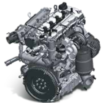
1.4L 2nd Gen U2 CRDi Diesel Engine