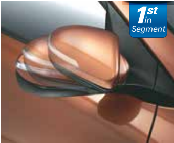
Auto-foldable Electric Mirrors with Welcome Function