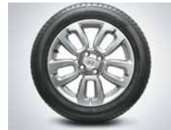
R16 Diamond Cut Alloy Wheels