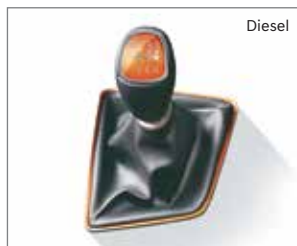
6-speed Manual Transmission