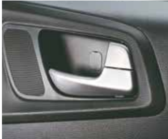
Impact Sensing Door Unlock & Speed Sensing Auto Door Lock