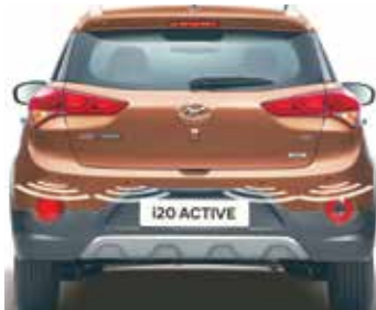
Reverse Parking Sensors with Camera